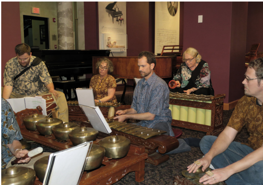
2019: Gamelan performers from Western Carolina University.