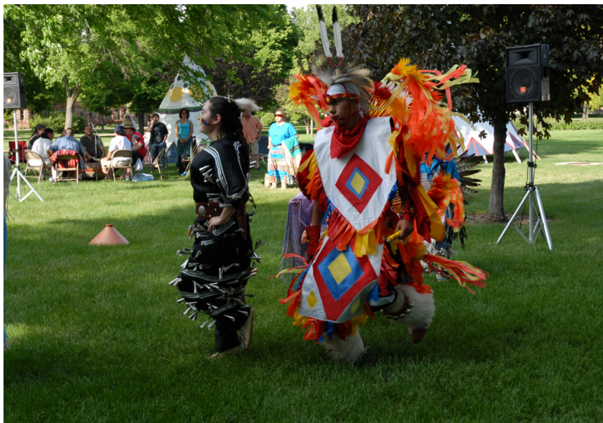
2006: Lakota tribe members demonstrate traditional dances at the National Music Museum.