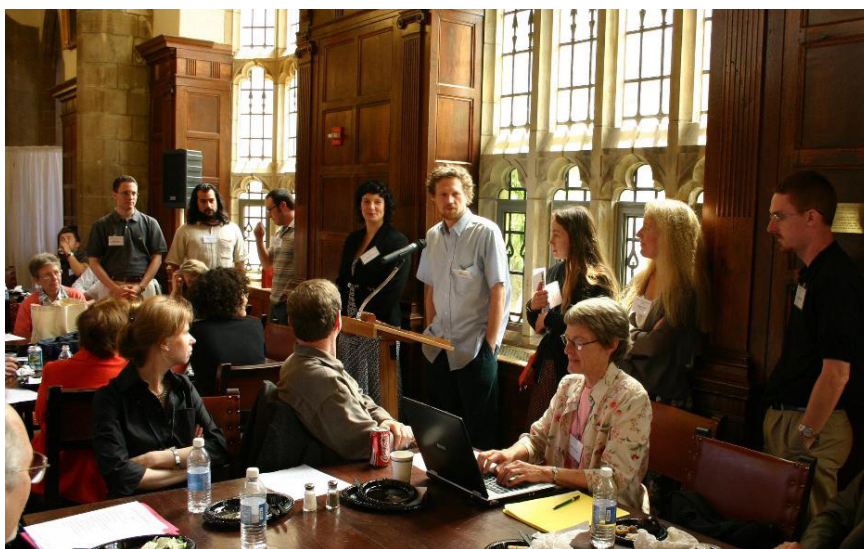
2007: Members meet in Saybrook College, Yale University.