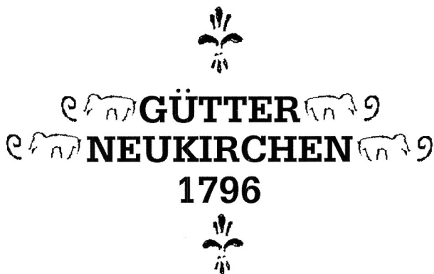
FIGURE 3. Sketch of the maker's stamp.